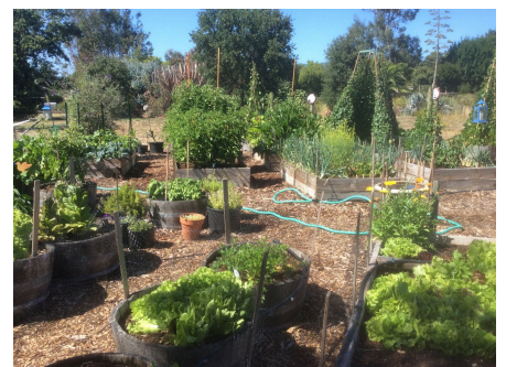
Faith Lutheran Garden

We can assist with accessing resources for your congregational garden project such as hand tools, seeding trays, row cover, shade cloth, or watering timers. We can also help with building new garden infrastructure or improvements such as raised beds, or composting bins. Your congregation may be eligible to receive a mini-grant of $500 or more for operating or infrastructure costs. We can also assist with planning, coordinating, and limited hands-on work as well.