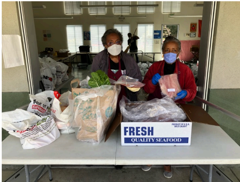
Fish distribution at St. Andrews Presbyterian Church in Marin City.