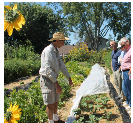
Interfaith Food Tour of Harvest for the Hungry

New this year: We will have an optional pre-conference tour of local farms and gardens committed to growing a more just and sustainable food system throughout the Bay Area. Sites will include: a 4 acre farm run by an immigrant farmer on the campus of Redwood Adventist Academy; Urban Adamah a Jewish community farm providing education about relationships between Jewish faith and food; and two community gardens. The tour will run from 9:00 am-1:45 pm August 25th, finishing in time for the start of the conference. This tour will include a boxed lunch featuring local food, and transportation for those who desire it. Reservations are limited, so you don't want to miss your opportunity to join us! To register, or for more information